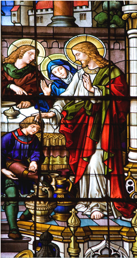
The Miracle at Cana, at Burgos Cathedral in Spain