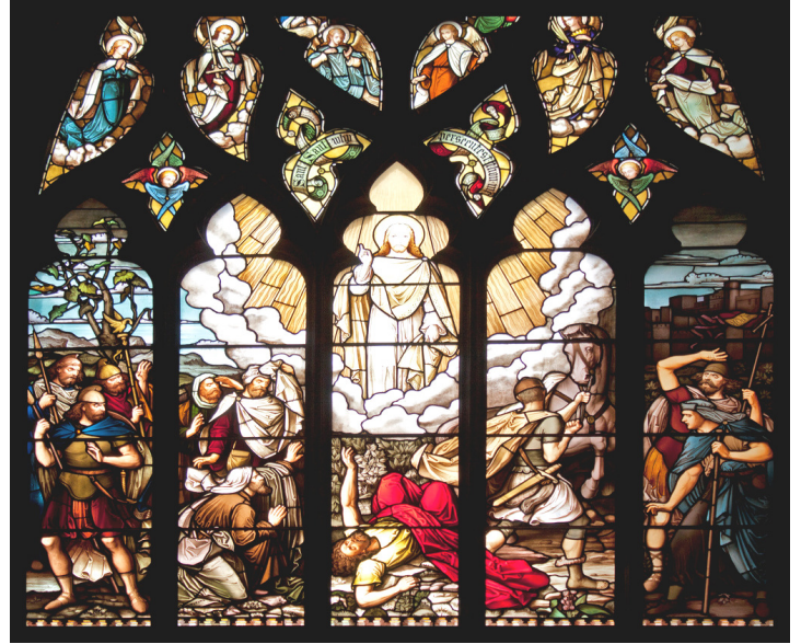
St. Paul encountering the Risen Lord on the road to Damascus and being called to be an Apostle, in St Giles' Cathedral in Edinburgh