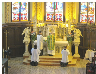
Holy Mass in the Extraordinary Form was offered for your intentions on Sunday, September 2, 2012 at 2:00 PM at Our Lady of the Assumption Church Windsor, Ontario, Canada