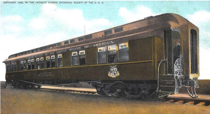
CHAPEL CAR "ST. ANTHONY" The Catholic Extension Society of the U. S. A. General Offices: The Rookery, Chicago.

Private rail cars have long been the province of politicians and the wealthy, but did you know that some have been outfitted to serve as Catholic chapels, hosting the Tridentine Mass? The Catholic Extension Society built at least three such cars. The St. Anthony Chapel Car is an early example, dating from 1908 and made out of wood.