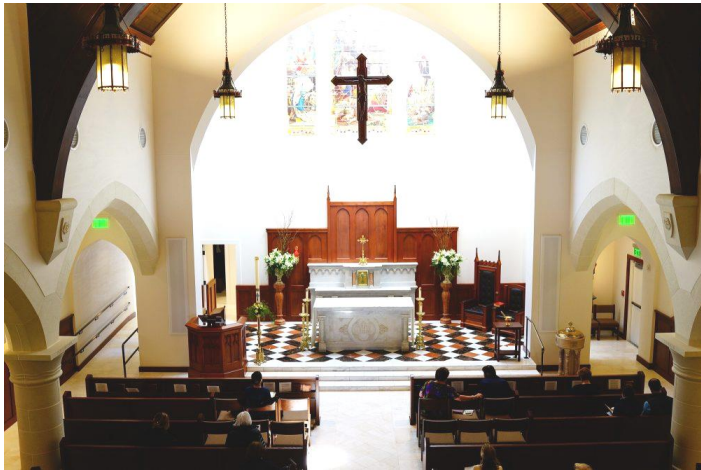
Christendom College Chapel

The Archdiocese of Boston is more recently known for closing churches, but in April it opened a new Shrine of Our Lady of Good Voyage to take the place of an older chapel. Designed by Cram & Ferguson, a Massachusetts church architecture firm featured on Extraordinary Faith whose founder designed St. Mary of Redford and Hamtramck's St. Florian Church, the chapel is traditionally arranged and boasts a relocated and restored High Altar.