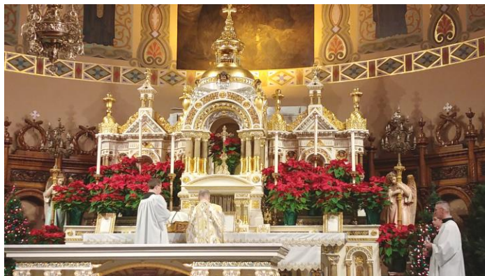
The Prayers of Preparation Before and Thanksgiving After Mass

Comments? Ideas for a future column? Please e-mail info@windsorlatinmass.org . Previous columns are available at www.windsorlatinmass.org .