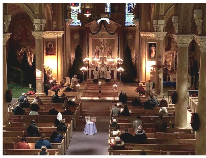
Tridentine Masses This Coming Week

The tradition of Roráte Masses continues in our region this year. These are Saturday Votive Masses of Our Lady in Advent, typically held before or at dawn and illuminated solely by candlelight, symbolic of awaiting the dawn of our Lord's coming. They are so named because the first words of the Introit of the Advent Saturday Mass of our Lady are Roráte cæli desúper (Drop down dew, ye heavens). These Masses are permitted on Saturdays of Advent of Third Class, which in 2021 are December 4 and 11. Variants of Roráte Masses are similarly candlelit Masses celebrated on other Feast Days of Advent, using the Propers of that day. Churches which have announced that they will be holding Roráte Masses or their variants this year include St. Thomas the Apostle, Ann Arbor (December 4, 11, and 18 at 7:00 AM); St. Matthew, Flint on December 4 at 7:00 AM; and St. Mary's of Redford on December 11 at 7:00 AM. [Photo of Our Lady of the Scapular, Wyandotte]