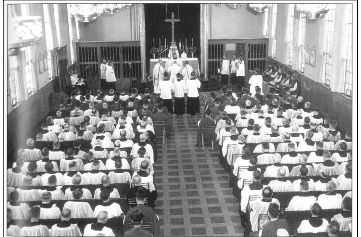
Until the completion of the seminary chapel, the library was temporarily pressed into service for worship. Here, priests, monsignors, and visiting bishops fill the pews at the 1948 dedication Mass at St. John Seminary.

Seminary enrollment kept growing. The Archdiocese built St. John Provincial Seminary in Plymouth to accommodate the need for priests. The decorum of those attending the seminary's 1948 (Tridentine) dedication Mass is palpable in this photo.