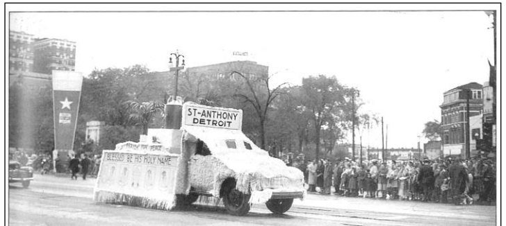
St. Anthony Parish on Sheridan near Gratiot in Detroit was represented in the Holy Name Parade along Woodward Avenue with this float in October 1951.

The book depicts thriving parishes with huge numbers of parishioners, and countless Catholic activities. One example is a Holy Name Parade down Woodward Avenue. Such a public expression of faith, especially for what might be seen as a relatively esoteric theological concept, would be unthinkable today.