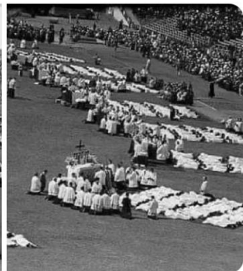
7:32 AM · 13 Sep 23 · 28.4K Views