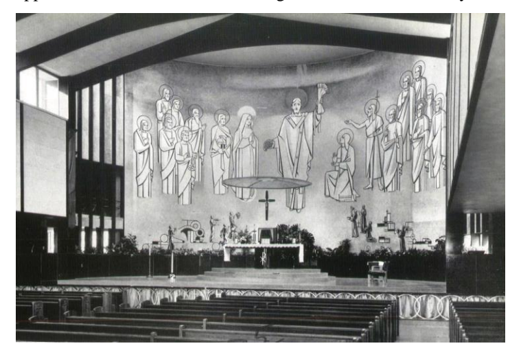
Tridentine Masses This Coming Week

This historic photo of Melvindale, Michigan's St. Mary Magdalen Church, built in 1955, reveals how some of the last churches built prior to Vatican II attempted to integrate a mid-century modern appearance with the traditional design of a Catholic sanctuary.