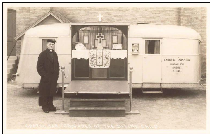
Historic Photo of St. Mary Magdalen, Melvindale

Una Voce Sevilla (Spain) posted this image of a chapel in a trailer from a Catholic Mission to China. Though we now have superior automotive and manufacturing technology, it's hard to imagine anyone thinking that such a portable chapel would have value today in any land, domestic or foreign.