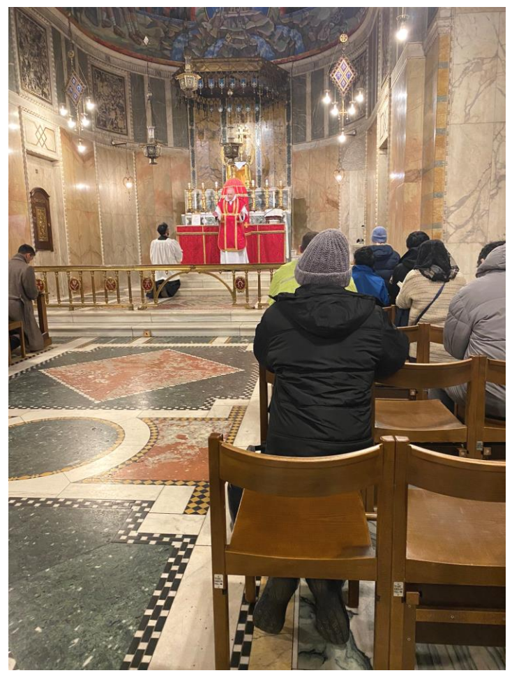
Tridentine Masses This Coming Week

They have also hosted arguably the longest-running Tridentine Mass in the world post-Vatican II, a 4:00 PM Mass held on First Saturdays, dating back to the issuance of the 1971 Agatha Christie Indult. This Mass has been held on one of their many Side Altars, for example in the Blessed Sacrament Chapel in the case of this December 2 photo by Lucy Shaw.