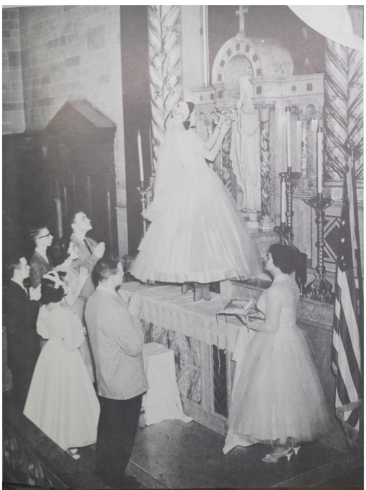
Tridentine Masses This Coming Week

<u>Tue. 04/16 6:00 PM:</u> High Mass at St. John Resort Chapel, Plymouth (Feria)